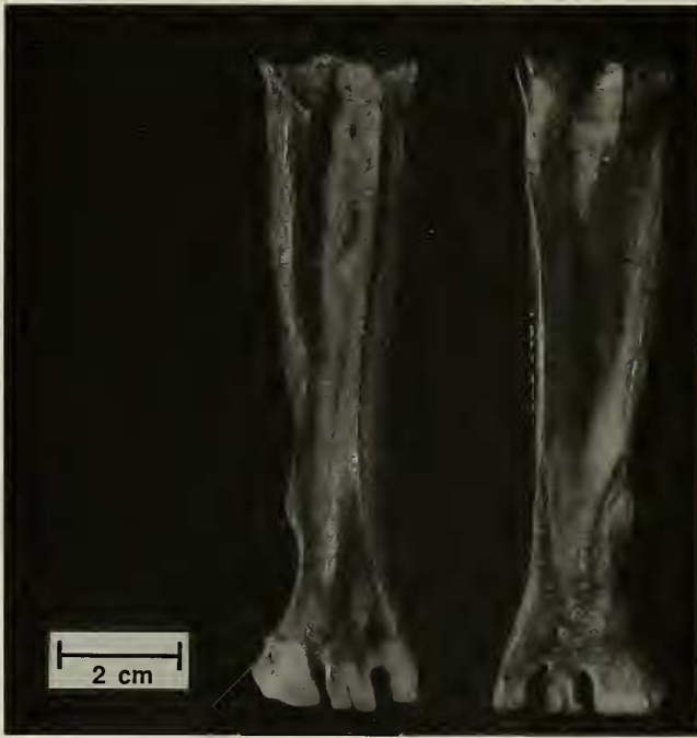
Fig. 1. Tarsometatarsus of Stephanoaetus mahery , new species, holotype, MAD 5491, Muséum National d'Histoire Naturelle, Service de Paléontologie, Paris, left dorsal and right ventral views.

in 1972, Burney 1987). In general, little is known about what effects these changes have had on the avifauna. The best known group of extinct birds on the island is the elephant birds (Family Aepyornithiformes) which consisted of at least seven species in two different genera (Brodkorb 1963). The exact sequence of events that led to their extinction is unknown, but at least one species may have been extant until the turn of the 17th-century, about the same time Europeans arrived on Madagascar (Flacourt 1658, p. 165). Other smaller bird species are known to have gone extinct in the past few millennia (Milne Edwards & Grandidier 1895, Andrews 1897, Goodman & Raoavy 1993).